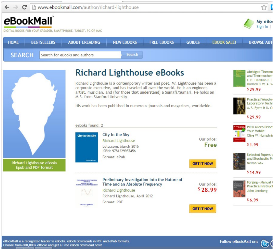
Figure 2. Two books on Ebookmall at present.