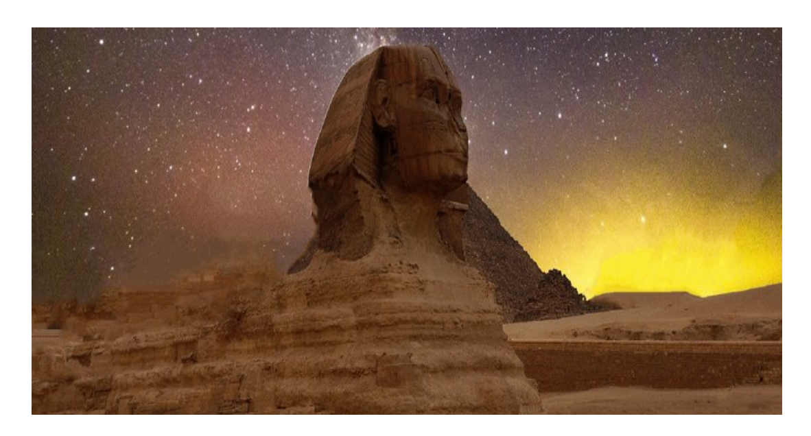
Day 04: 07th of September - Egyptian Museum & Fly to Luxor:

Meals: Breakfast / Overnight: Hotel in Cairo - Four Seasons First Residence Hotel or similar.