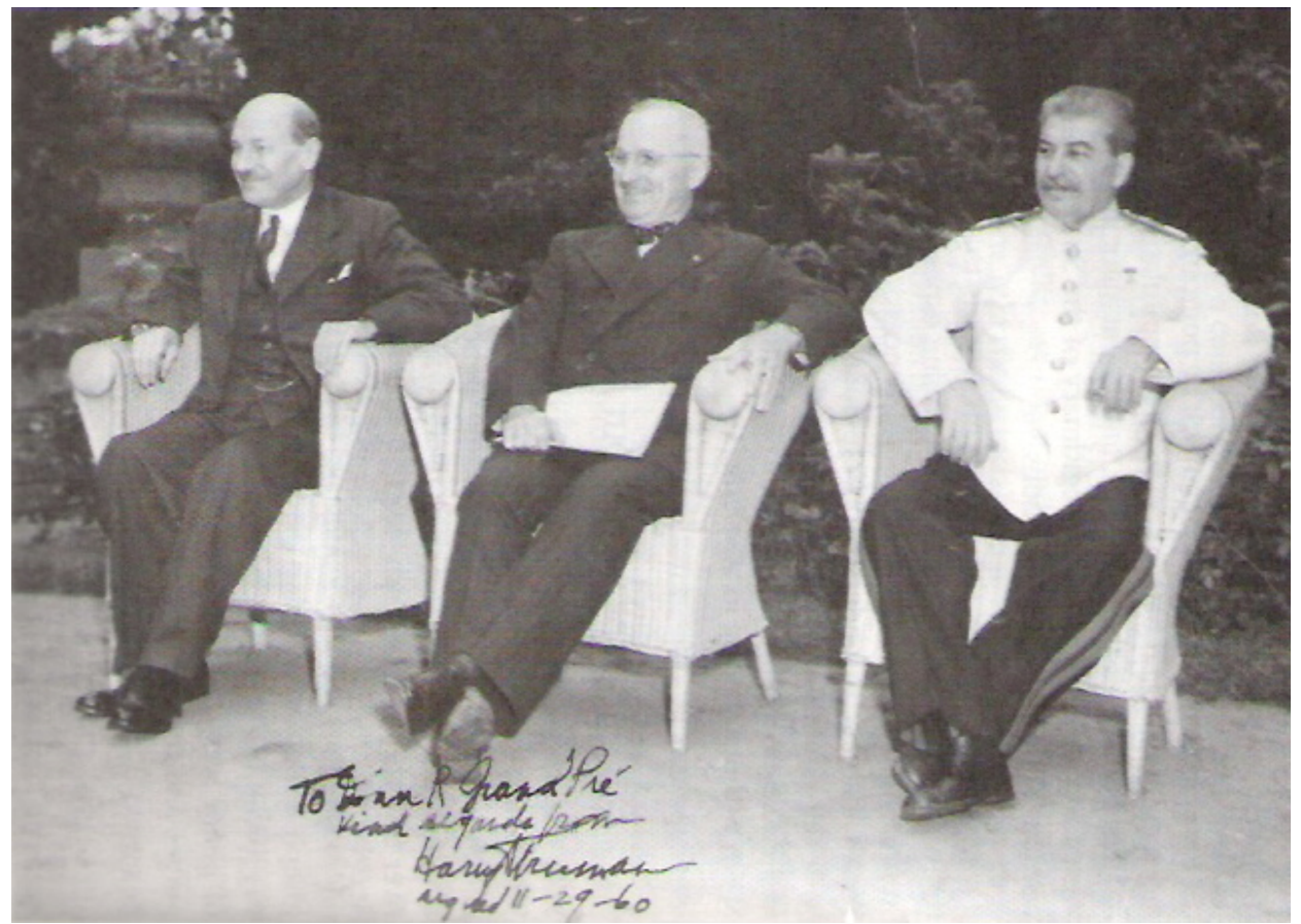
(page 264, Rattler's Revenge)