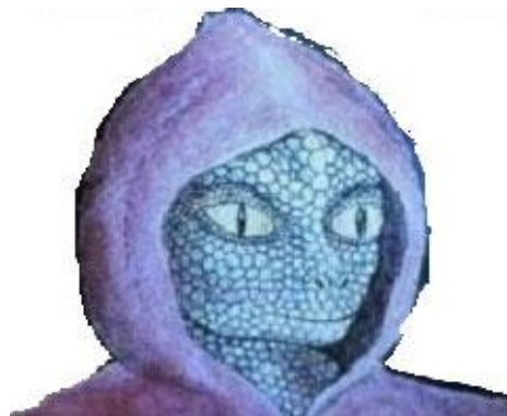
Figure 7: Reptilian "gargoyle type"?