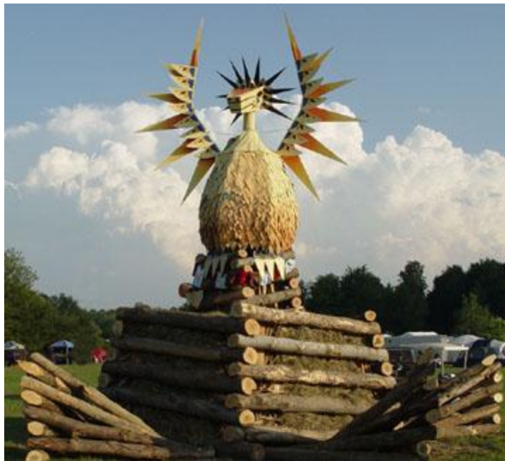
Figure 5: From the Sirius Rising Festival