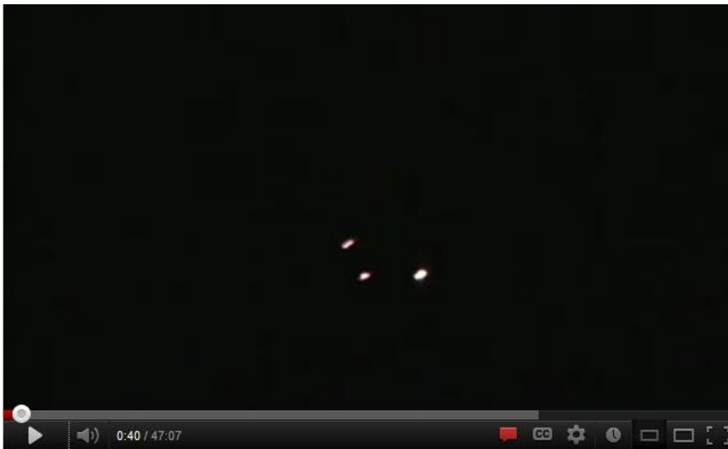
Figure A-9. UFOs over Hessdalen (snapshot from the video presentation, 'The Portal')

I took a snapshot of the video, only 40 seconds into it. Where have we seen this exact formation before? That's right, over Lake Erie! No doubt about it. I snapped this one in the precise moment when the lights created the famous triangular formation: