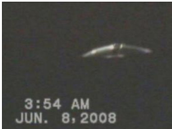
Figure A-22. Frame of video taken of craft hovering over Lake Erie.

Today, most people think of Men in Black as three entertaining comedic films, released on purpose so the masses can laugh, both at the film and at those who think it has some real substance to it, but back in the 50s no one was laughing.