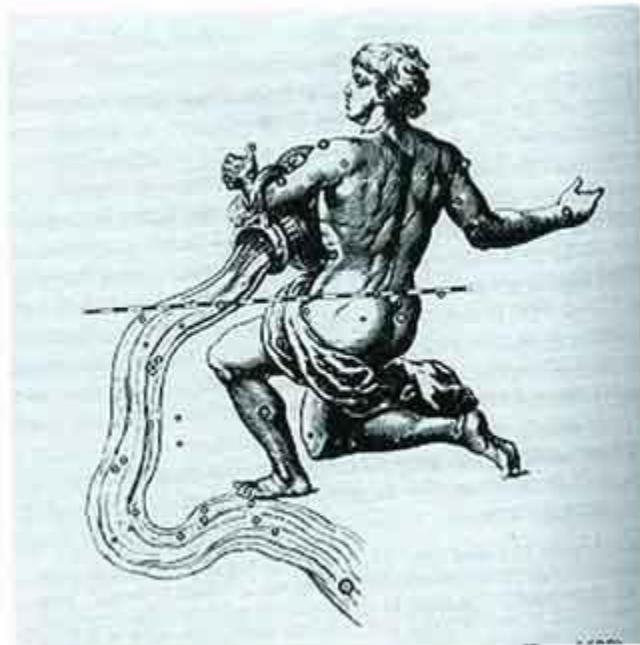
The constellation of Aquarius (Hevelius, 1690).