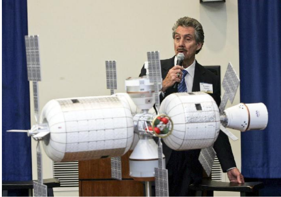
Figure A-13. Billionaire Robert Bigelow, big UFO 'enthusiast'?

However, the above debate is probably not even what is the most relevant. In a policy from the U.S. Department of Transportation, Federal Aviation Administration, Order JO 7110.65U with effective date, February 9, 2012, it says under Section 8. Unidentified Flying Object (UFO) Reports: