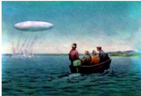
Figure A-24. Artist's depiction of UFO ascending from underwater, including witnesses

The record of incidents since 2000 has ticked upwards and it's safe to say that more UFOs are being tracked, seen and encountered in the Lake Erie area than during all previous years.