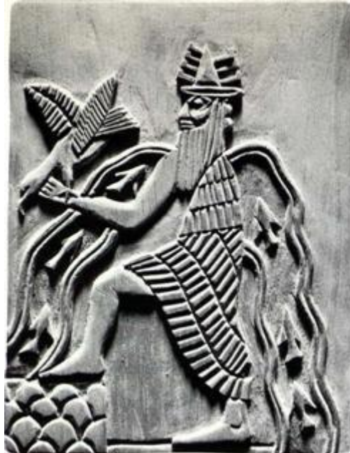
Figure A-27. Prince EA (ENKI) and the stream of water.

Enki was depicted by the Sumerians as a seated deity outpouring streams of water.