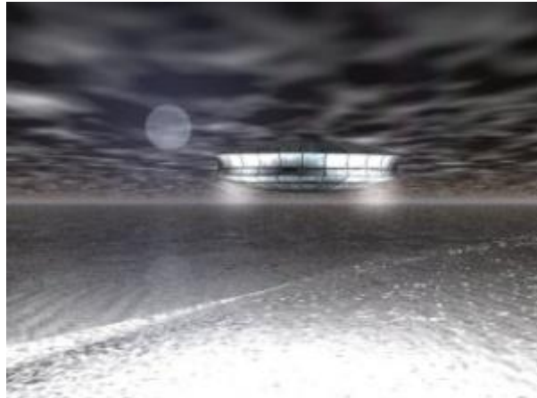
Figure A-23. Artist's depiction of incredible U.S. Coast Guard sighting.

In his book, A Hidden Underwater UFO Base in Lake Erie Swope describes sustained UFO flaps and many sightings of massive craft plunging into the lake.