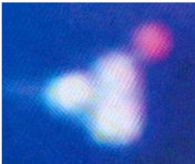
Figure A-8. The famous mysterious lights over Hessdalen, Norway

These unusual lights have been reported in Hessdalen since at least back in the 1940s. However, there was a great increase in these sightings over the period of December 1981 until the summer of 1984, when people could apparently see the lights as often as 15-20 times a week. Then the amount of sightings decreased again to a relatively steady amount of 10-20 sightings a year, in average.