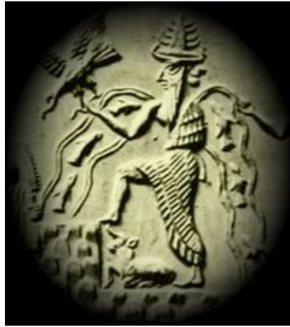
Figure A-25. Lord ENKI

Benjamin Creme is a Scottish author, artist, and esotericist, with connections to the Theosophical Society, once founded by Madame Helena Blavatsky. Creme is probably the best known spokesman for the coming of 'Maitreya the World Teacher' [22] The Theosophists, through Annie Besant, once tried to introduce Krishnamurti as the Maitreya, but he later separated himself from them and became a teacher on his own.