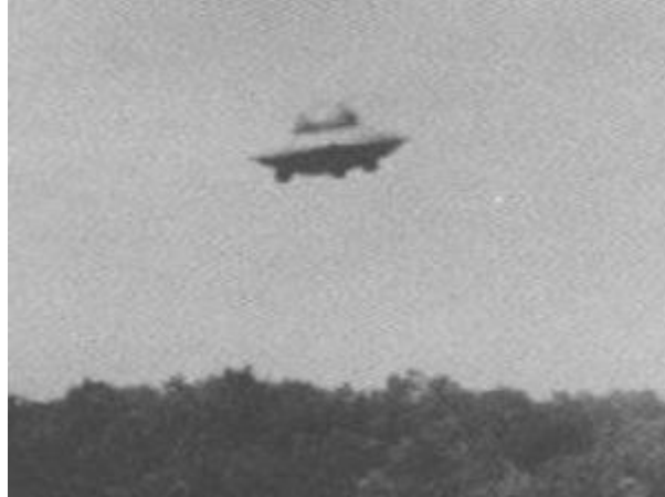
Figure A-19. Classic saucer-shaped UFO over Cleveland area, 1954; the so-called 'George Adamski Type'.

In modern time, it's been debated for decades that Lake Erie harbors a base, perhaps both underwater and underground near the lake, as we shall see in a moment.