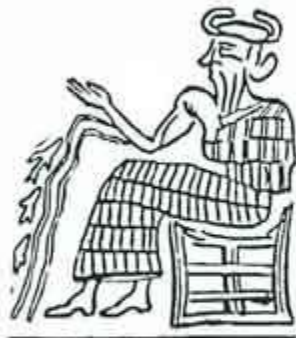
Enki in Sumerian Depictions