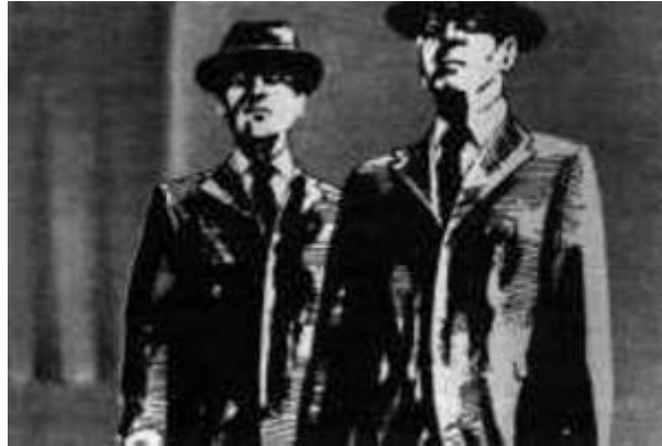
Figure A-21. The ominous 'Men in Black' investigated some Lake Erie sightings.

The more interesting investigations in that time was performed by nameless, ominous men, looking quite identical to each other, who only identified themselves as 'representatives of the United States Government'. These mysterious men interrogated the witnesses, trying to intimidating them into silence. These men, with their specific characteristics, became known in the Flying Saucer circles as the 'Men in Black'. The results of their investigations were never released. Alien clones, somebody?