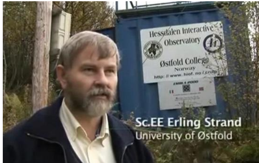
Figure A-10. Researcher Dr. Erling Strand, University of Østfold, outside the 'Hessdalen Interactive Observatory'

The video presentation, 'The Portal' (Multimedia A-3 above) is a 47 minutes long video, filled with very reliable eye witnesses that have all seen similar things. The light phenomena are changing speed, indicating no mass by physical means, and "seems to be able to take on pieces of plasma or energy from the ground while passing by". [6] The same thing has been reported regarding the Eastlake UFOs. 'The Portal' continues the presentation by saying, "The phenomenon seems to radiate energy, due to the light and frequent change of color". [7] But also, some eye witnesses have, in connection with the sightings, felt the foul smell of sulphur. Apparently, in 2004 the scientists detected the light phenomenon several times, directly above a specific sulphur mine outside the village. "So this mine must be very special", says one of the interviewed locals of Hessdalen. [8] Although these lights have been seen hovering above the sulphur mine, it's just another theory, they add. The lights do not follow any fixed pattern, and certainly don't always hover over sulphur mines.