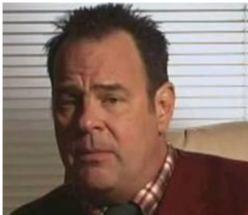
Figure A-16. Dan Akroyd