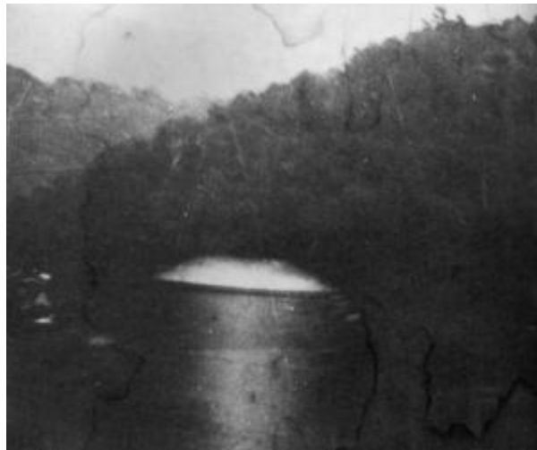
Figure A-18. UFO snapped over Lake Erie in 1952.

There are with no doubt a lot of UFO bases on our planet. Some of them are pure military, using reverse engineered alien technology, while others are shared bases between the military and different star races (mostly of the Sirian Alliance), and some are pure alien UFO bases. They are located all over the world, even in such remote areas as the Arctic and Antarctica (or especially in those remote places, I should say), but also in places like the Andes mountain ranges in South America, where one of the biggest UFO bases is allegedly located. Every big continent has them, as it seems. In North America, the biggest one in the world, allegedly, is located in Lake Erie, and much of it is supposedly underwater!