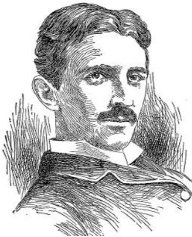
Figure A-12. Nikola Tesla

What we're seeing in the picture is the light starting out with the glowing orb to the left, moving all the way to the right, and back all the way to the left, past the start point. The distance between the far left and far right is estimated to be 10-15km, which is about 5-7 miles. The exposure time from the camera was 30 seconds. What surprises the scientists is when they look at the spectrum at the bottom (made on purpose by the camera lens) it's continuous over the spectra, from red to violet. The way the spectrum shows up indicates there is no gas or fuel that's running the 'engine' (if any), but it certainly looks like it could be a solid object, they say, or from plasma with high density, or molecular chemical compositions.