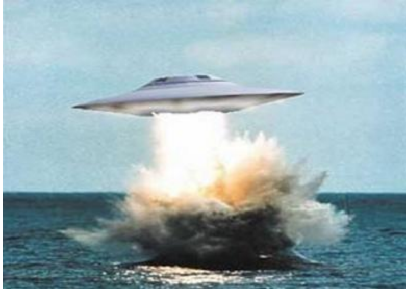
Figure A-17. Artist's impression of an underwater UFO.

There are with no doubt a lot of UFO bases on our planet. Some of them are pure military, using reverse engineered alien technology, while others are shared bases between the military and different star races (mostly of the Sirian Alliance), and some are pure alien UFO bases. They are located all over the world, even in such remote areas as the Arctic and Antarctica (or especially in those remote places, I should say), but also in places like the Andes mountain ranges in South America, where one of the biggest UFO bases is allegedly located. Every big continent has them, as it seems. In North America, the biggest one in the world, allegedly, is located in Lake Erie, and much of it is supposedly underwater!